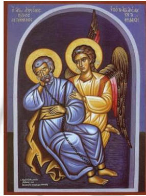
Sambata icon of St Peter ad vincula