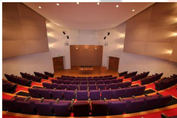
Cripps Court Auditorium